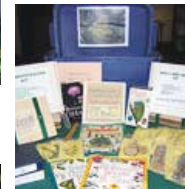
Trees & Plants